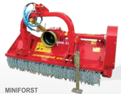
MINIFORST classic forestry version without pick-up device 55 - 90 HP required at the PTO mulches wood up to 12 cm [4,7"] Ø

Tough mulcher with pick-up device for material feed and screen, to obtain a fine and uniform mulch.